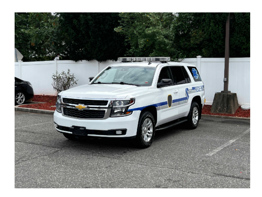
2015 Chevrolet Tahoe 4X4 First Responder